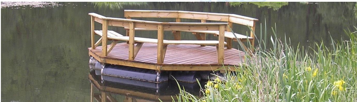
Picture 3. Floating bridge