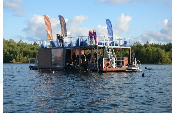
Picture 2. Paekalda Holiday Center raft