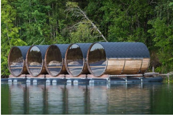
Picture 1. Barrel campings of Paekalda Holiday Center raft

The main field of application for pontoons are floating bridges, rafts, floating saunas and bog paths. The pictures below are some photos of the use of pontoons made by HAKA Plast.