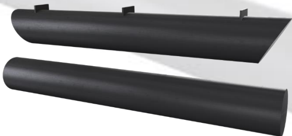
Picture 4. HAKA Plast pontoons

Thanks to the pontoon manufacturing technology developed by HAKA Plast, the pontoons are waterproof and safe to use. Pontoon pipes are made of PEHD REG material. During the production of the pontoon, a PE plate is fused to the pipe ends and according to the customer's wishes, also fixing ears can be mounted. If the floating structure is intended to move in water, the ends of the pontoons can be made streamlined, ie at an angle of 45^\circ .